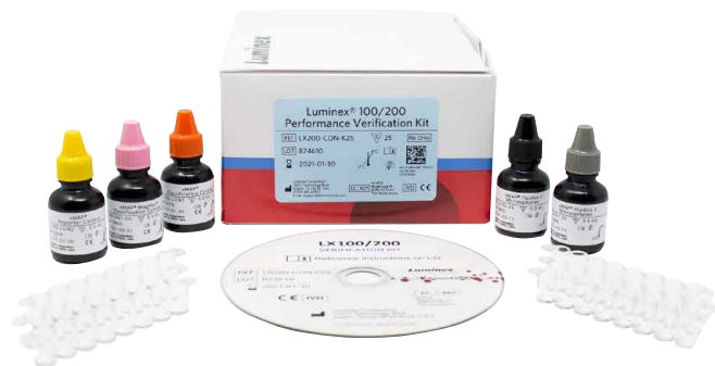
Luminex® 200™ Performance Verification Kit