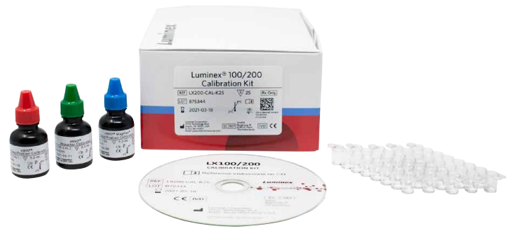
Luminex® 200™ Calibration Kit