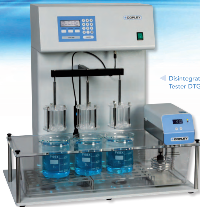
◀ Disintegration Tester DTG 3000