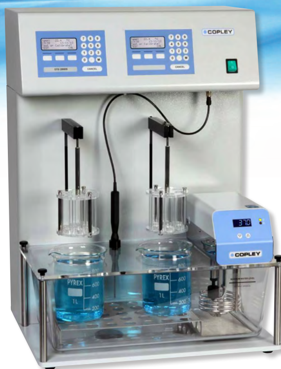
▲ Disintegration Tester DTG 2000 IS