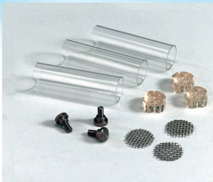
▲ Left: Basket fitted with Special Cover Right: Special Basket for Large Tablets Glass Tubes, Fluted Discs and Sieve Meshes ▲