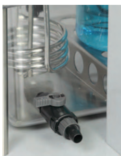
Drain tap used on rear of DTG 3000 and DTG 4000 water bath