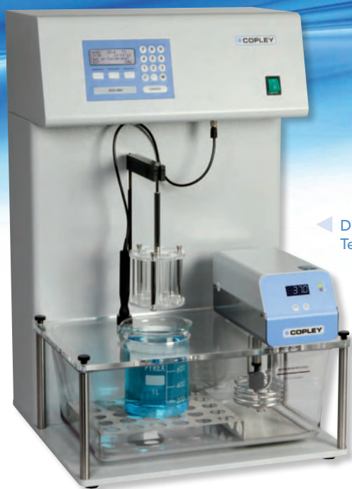
◀ Disintegration Tester DTG 1000