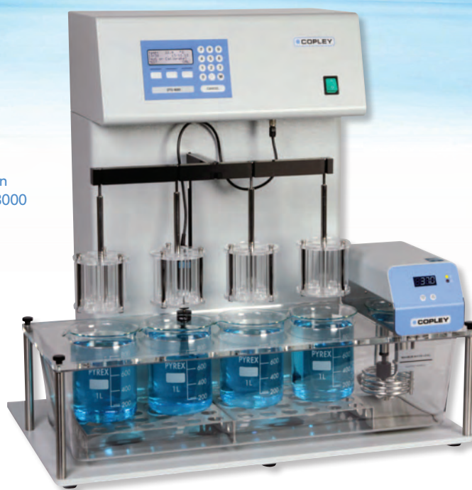
Disintegration Tester DTG 4000 ▲