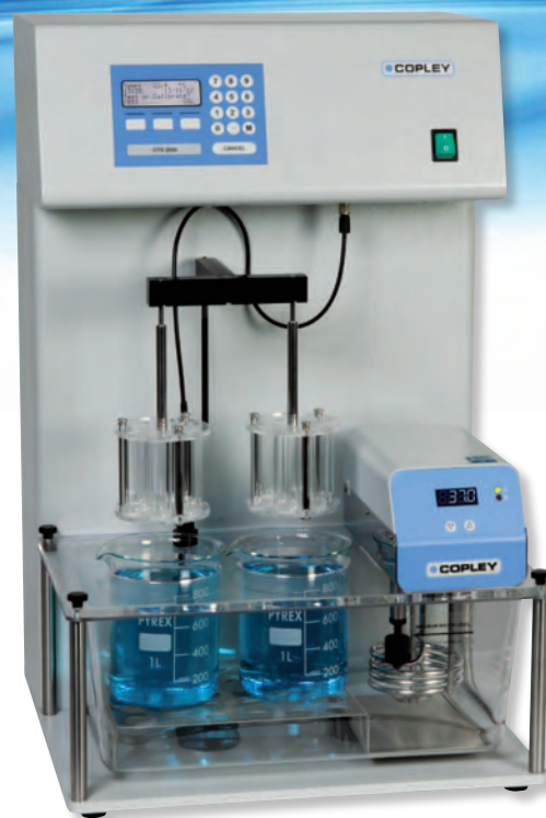
Disintegration Tester DTG 2000 ▶