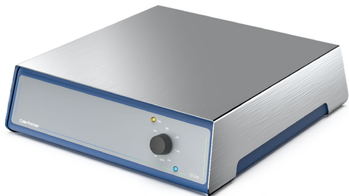
ST-200-L-S 230V: 04807-74 120V: 04807-75