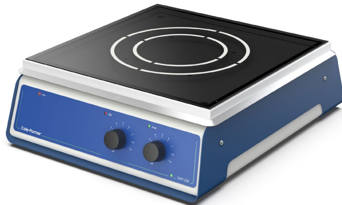
SHP-200-IR-L 230V: 04807-86 120V: 04807-87