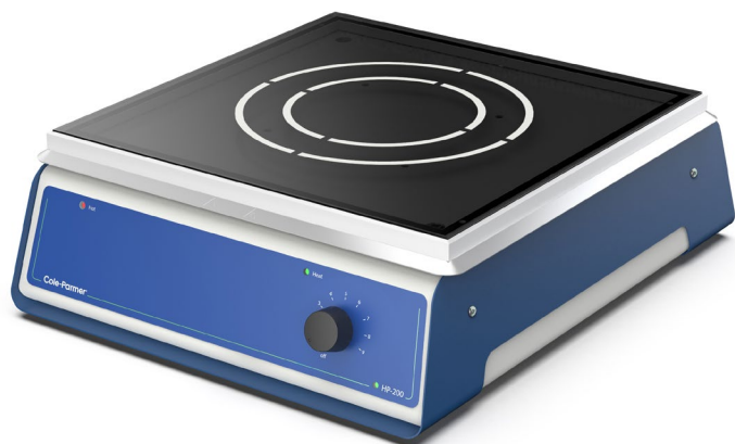
HP-200-IR-L 230V: 04807-84 120V: 04807-85