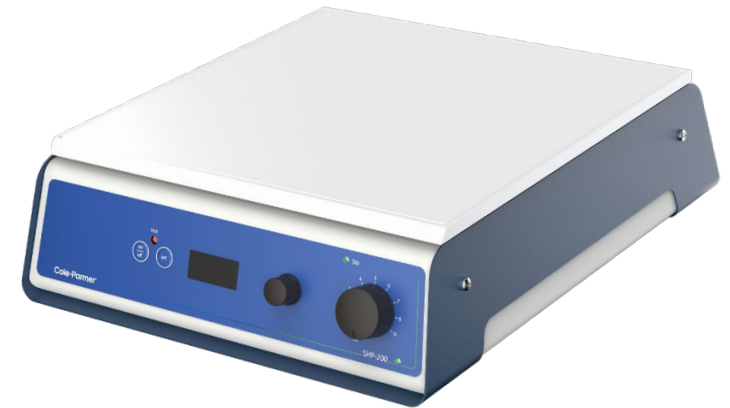
Hotplate Stirrer SHP-200D-L-C