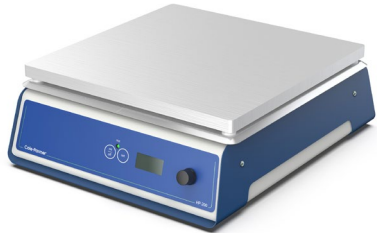
HP-200D-L-S 230V: 04807-80 120V: 04807-81