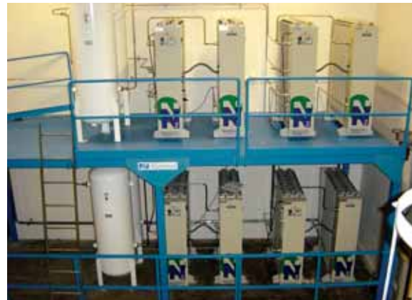
Modified Atmosphere Packaging installation.