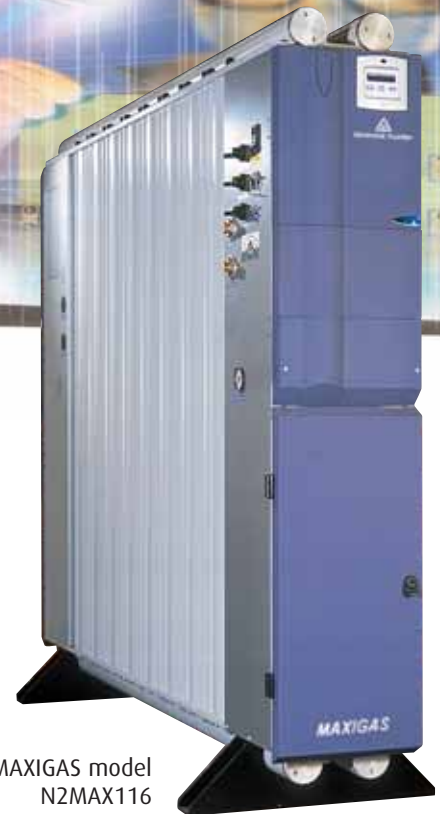
MAXIGAS model N2MAX116

Producing nitrogen from compressed air with MAXIGAS can cut your operating costs significantly. No on-going cylinder costs; i.e. rental, re-fill, delivery, order processing.