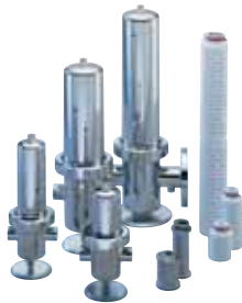
Sterile Air Filters