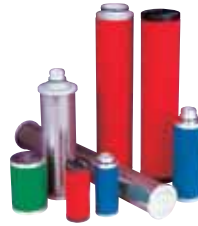
Compressed Air Filter Elements