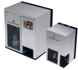
Compressed Air Refrigeration Dryers