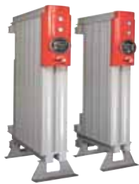
Compressed Air Desiccant Dryers