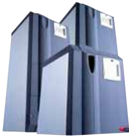
Laboratory Gas Generators