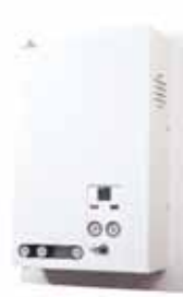
Mixed Gas Dispense Systems