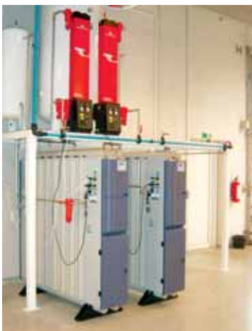
Nitrogen blanketing for electronics production.