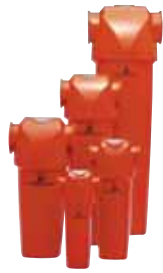
Compressed Air Filters