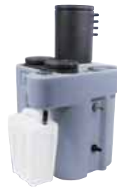
Oil / Water Separators