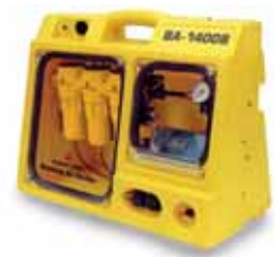
Breathing Air Purifiers