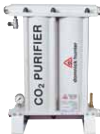
Carbon Dioxide Purifiers