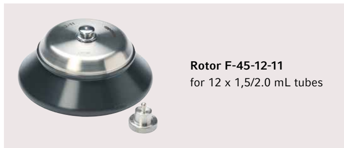
Rotor F-45-12-11 for 12 x 1,5/2.0 mL tubes