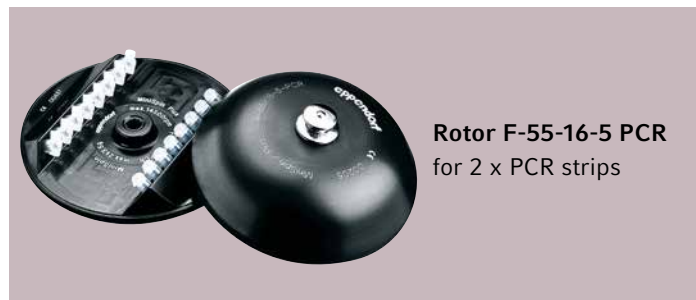
Rotor F-55-16-5 PCR for 2 x PCR strips