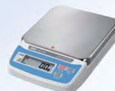
Stainless Steel Pan (optional)