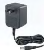
AC Adapter (optional)

Options Stainless steel pan (HT-10) AC adapter