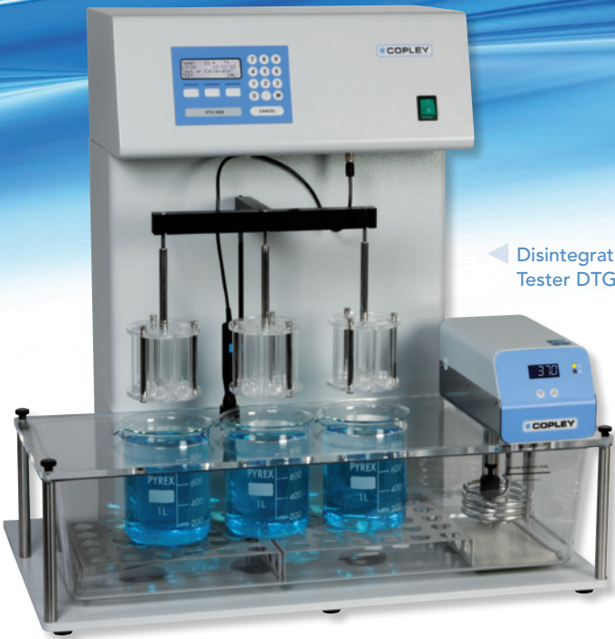
Disintegration Tester DTG 3000