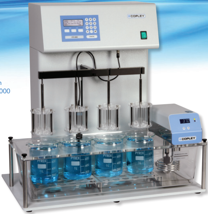
Disintegration Tester DTG 4000

This means that if it is necessary to disassemble the basket before cleaning, this can be done very quickly and without the use of any specialised tools. A common problem associated with fabricated water baths, used for warming the media, is that of leaks. This problem has now been eliminated through the use of a one-piece water bath vacuum formed in rigid PETG. This construction not only eliminates any possibility of leaks, but also makes it far easier to clean because of its rounded corners. The bath is fitted with a sturdy 8 mm clear view lid and secured to the base by four easily removed thumb screws. The temperature of the warming solution is controlled by means of an independent digital heater/circulator to an accuracy of +/- 0.25 degrees C . This has two advantages: firstly, it removes the necessity for priming and secondly, it can be removed for cleaning without dismantling the whole disintegration tester. A low water-level alarm indicator is built into the unit as standard.