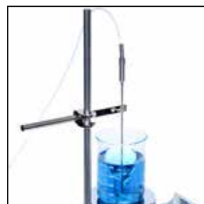
Support Rod and Clamp Kit