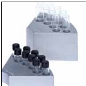
Vial and Test Tube Blocks