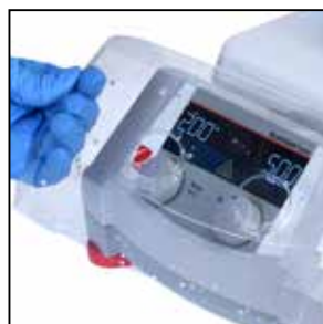
In Use Cover