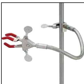
Ultra Flex Support Kit