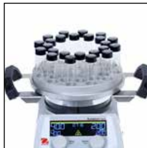
Base Plate and Handles