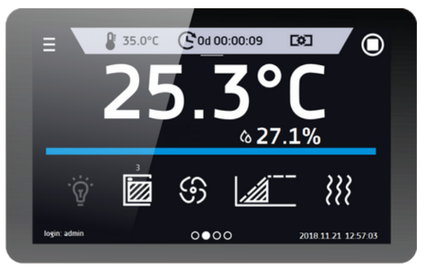
Smart PRO - preview screen