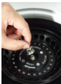
Picture 8 Nut for Rotor

Please check before each run if the rotor nut is tightened and that rotor lids, caps and inserted carriers are closed correctly. If unusual noises occur when the centrifuge starts the rotor, the rotor lid or cap may not be properly secured. Please stop centrifugation immediately by pressing the STOP key.