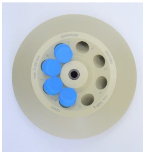
Picture 12 Wrong