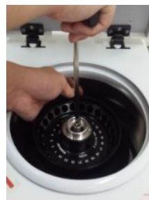
Picture 9 Tool for rotor without nut