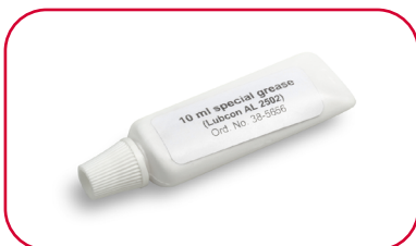
Vaseline (OHAUS pn: 30314586)