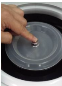
Picture 10 Snap-on lid