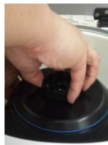
Picture 11 Screw-on lid