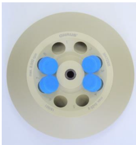
Picture 13 Correct